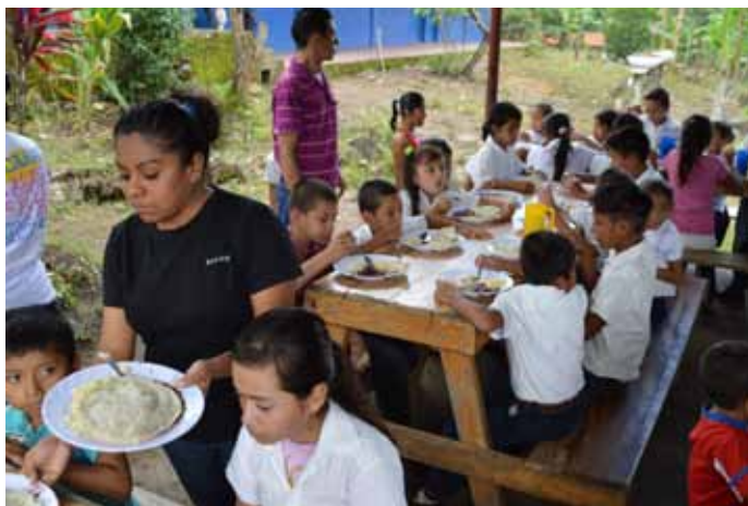
Lunchtime at Aguas Amarillas School, El Tuma La Dalia, Nicaragua.

The first chapter of this booklet focuses on the school feeding story in Brazil and is based on a four-day technical visit to the state of Santa Catarina, organized as an activity of the Strengthening of School Feeding Programmes. Participating countries included Antigua and Barbuda, Barbados, Costa Rica, the Dominican Republic, Ecuador, El Salvador, Guatemala, Jamaica, Paraguay, Peru, St Lucia and Venezuela.