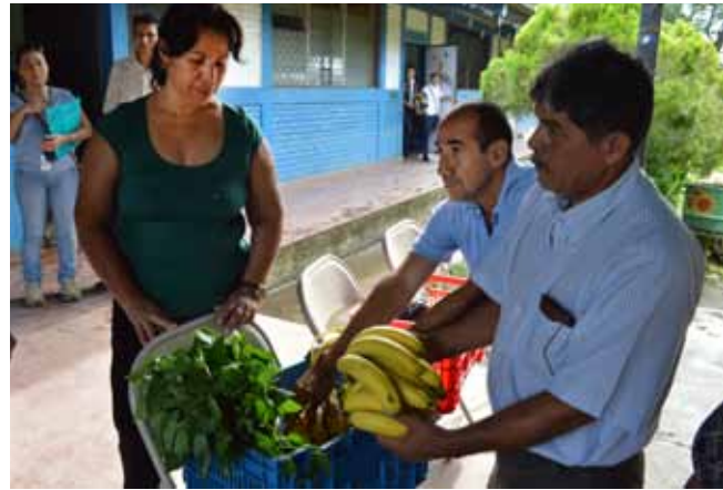
Farmers from ACOPATE delivering fresh fruit and vegetables to Cantón Las Lajas School.

In some schools, teachers take charge of the delivery; in others, pupils on the school purchasing committee are responsible for weighing the deliveries