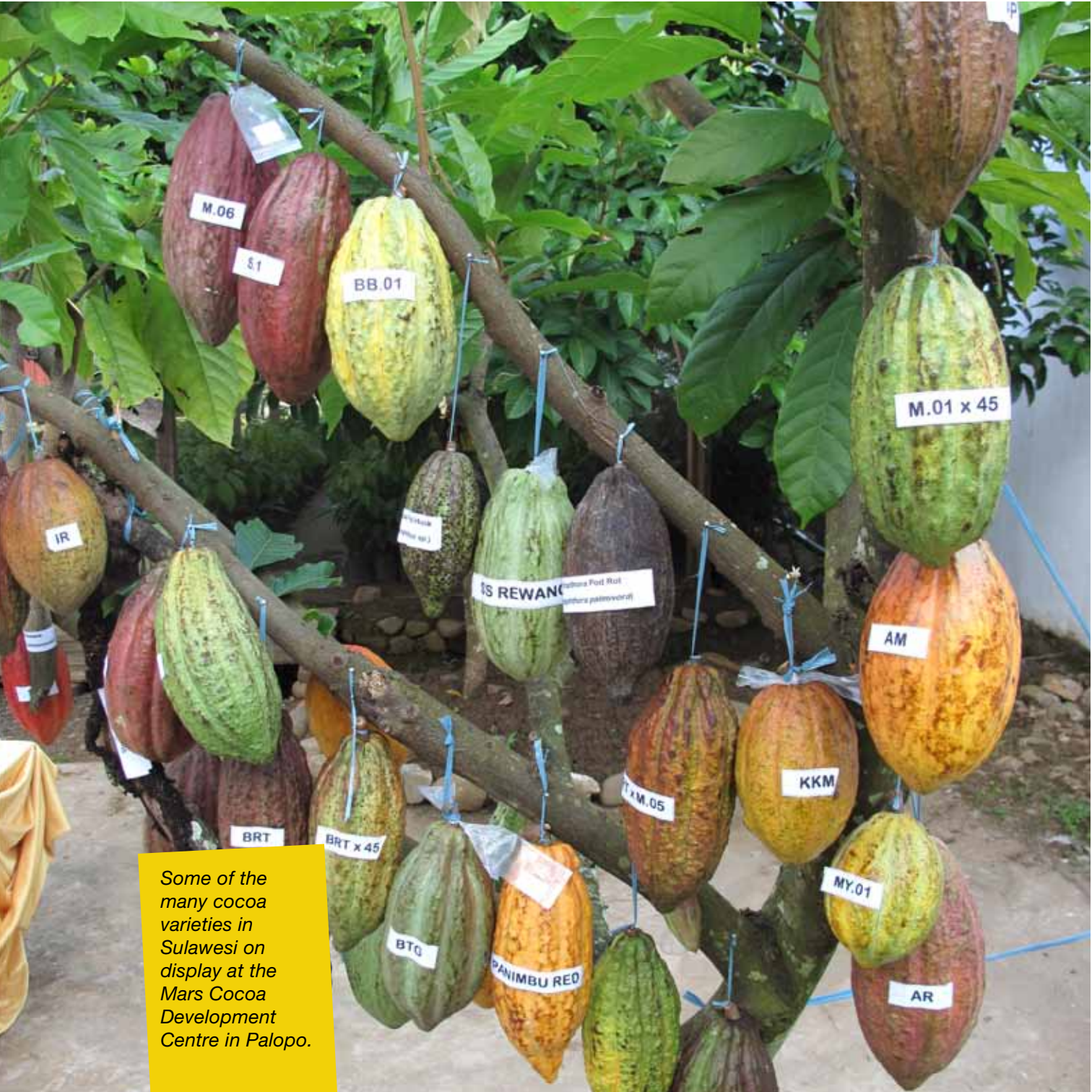
Some of the many cocoa varieties in Sulawesi on display at the Mars Cocoa Development Centre in Palopo.