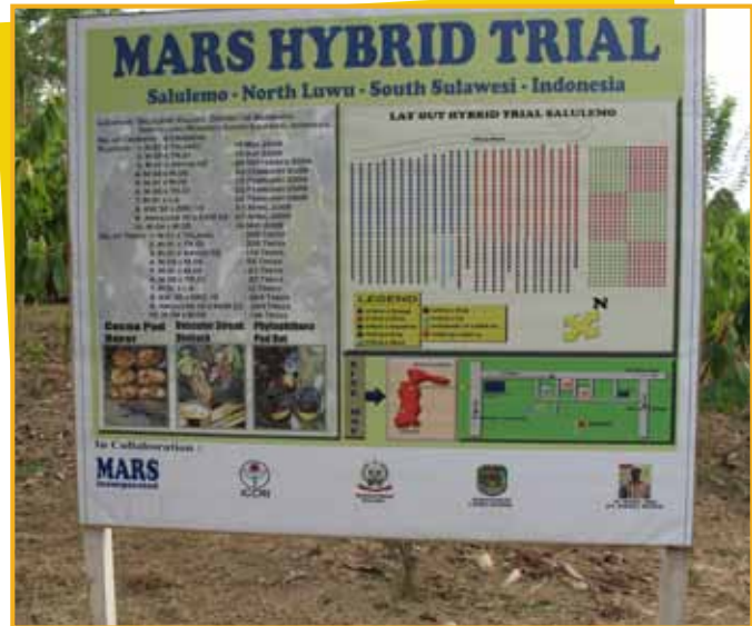
▲ Mars and its partners have invested heavily in developing new varieties of cocoa at research sites in Sulawesi..