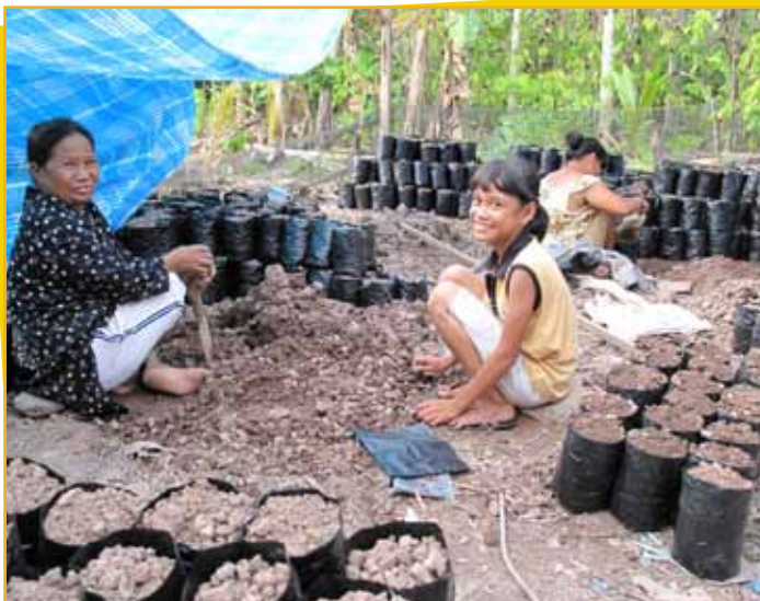
▲ It's a family business. Filling polythene bags for cocoa rootstock at a village cocoa clinic.

Prior to launching its training programmes in the field, Mars pays great attention to what Hussin describes as socialization.