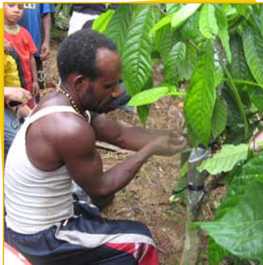
▲ Learning to graft at the Mars Cocoa Development Centre in Alang Alang, Papua.