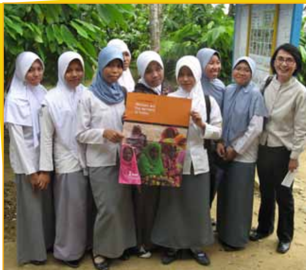
▲ Students at Bone Bone vocational college. The poster reads, ‘Women are the farmers of today’.