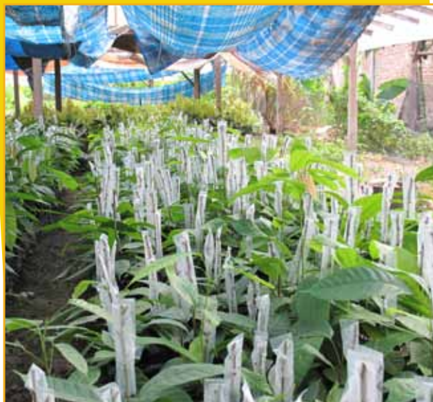
▲ Village cocoa clinics such as this one serve up to 170 farmers each.

Mars has pledged that by 2020 it will only buy third-party certified sustainable cocoa, and South Sulawesi has been the