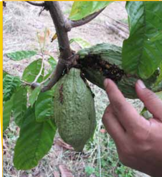
▲ Early work by Mars in Sulawesi focused on reducing losses caused by pests and diseases.

"We chose the area around Noling, in South Sulawesi, as the place to launch PRIMA because the farmers here had so many problems," he recalls. They were suffering heavy losses caused by pests and diseases, their beans were of poor quality and their trees were old. Hussin identified 743 farmers with around 1000 ha of contiguous cocoa gardens and divided the area into eight zones, placing field