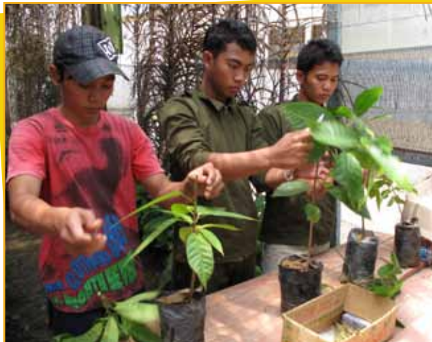
▲ In 2010, 240 students at Bone Bone chose cocoa as their specialist subject. Some will go on to become trainers and extension workers.

Mars first began to work with the vocational colleges in 2007 after Hussin had given a presentation to staff at Bone Bone SMKN, in North Luwu Regency. At the time, there were just 200 students at Bone Bone, seven of whom were studying agriculture. After the presentation, the headmaster asked Hussin to write the curriculum for a new cocoa course and provide training for teachers. The timing was propitious as the Government of Indonesia was