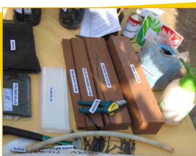
▲ Building blocks to a better life – the tools farmers need to establish a cocoa nursery.

The seeds of this uncommon collaboration were sown in 2005, when Mars and the International Finance Corporation (IFC), the private-sector financing arm of the World Bank, convened a meeting to discuss the future of the cocoa industry in Indonesia. It was clear that none of the existing programmes, including PRIMA, was capable of solving all the problems facing the industry. What was needed was a joint effort: hence the creation of the Cocoa Sustainability Partnership (CSP).