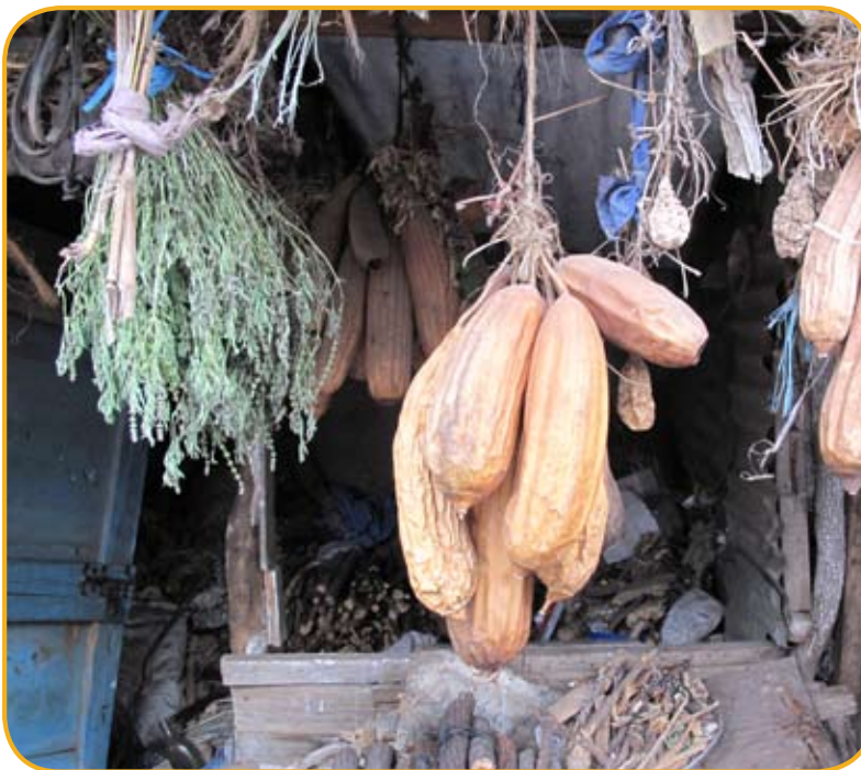
▲ The ngitili are an important source of medicinal plants.

Tanzania is one of the most stable countries in the region, but it remains among the poorest. In 2008, the gross national income per capita – a measure of relative