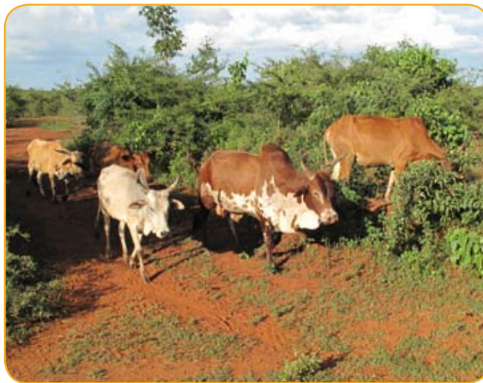
▲ Not quite a thing of the past: cattle grazing illegally in a protected area.