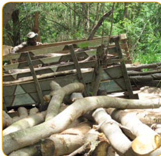
▲ Woodlots provide a significant income for many farmers.

The researchers also provided an estimate of the average annual value of 16 major products