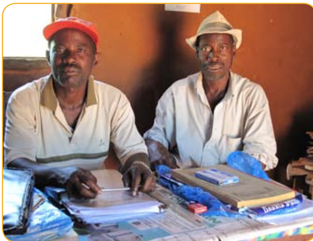
▲ Local government staff have been closely involved in the HASHI project. The chairman and executive officer of Igung'hwa village.