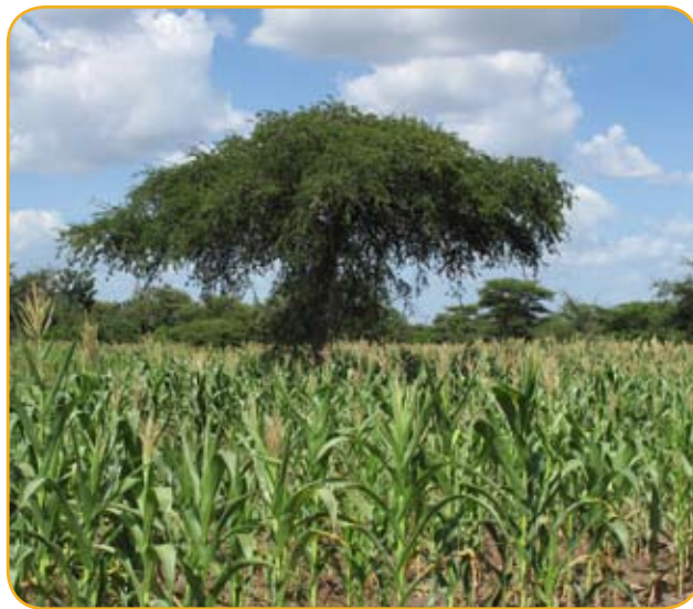
▲ Maize yields beneath Faidherbia trees are often higher than yields beyond the canopy.

Thanks to HASHI, many families are now planting nitrogen-fixing legumes such as Gliricidia , Calliandra and Leucaena . Some they grow as fodder for their dairy cow; others specifically to improve fertility and