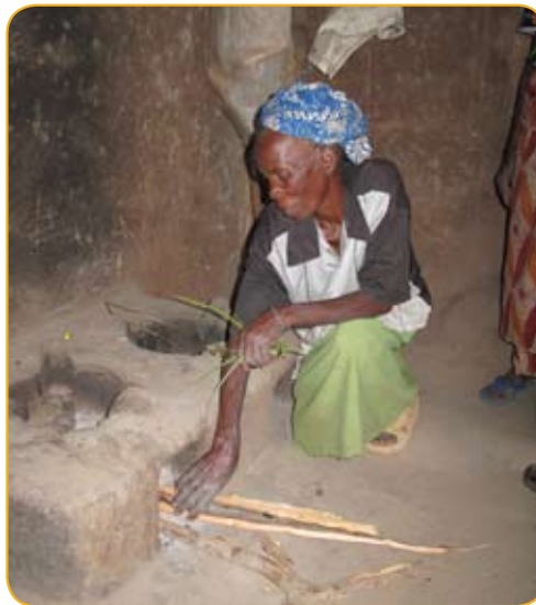
▲ The restoration of the ngitili has helped reduce the time women spend gathering fuelwood.