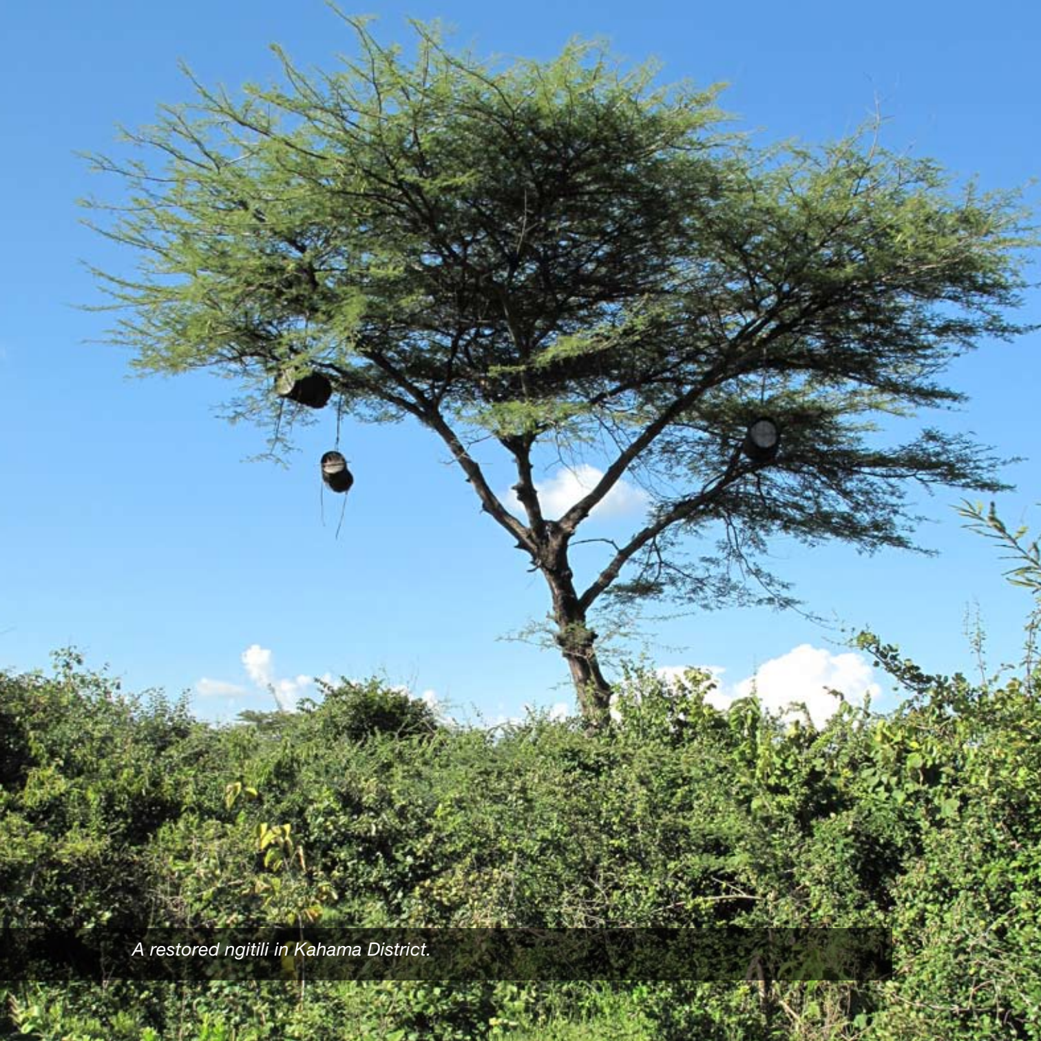
A restored ngitili in Kahama District.