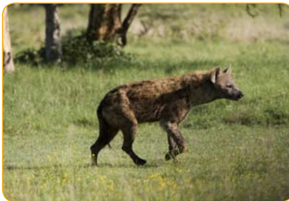
▲ Many species of mammal, including hyena, are now flourishing in Shinyanga Region, thanks to the HASHI project.