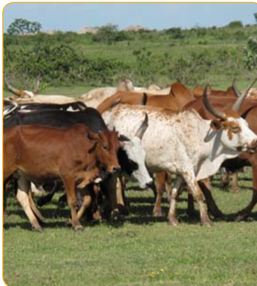
▲ Farmers report that their cattle are now in better health, thanks to a year-round supply of nutritious fodder.

However, the programme was an environmental catastrophe. By the time it came to an end, shortly after the Second World War, vast areas had been cleared and the environmental transformation was to continue over the coming decades. The human population rapidly expanded, leading to an increase in demand for fuelwood and cropland, and so did the number of livestock. This inevitably led to the overgrazing of pasture and woodland. At the same time, large areas of land were devoted to cash crops like cotton and tobacco, leaving less land available for