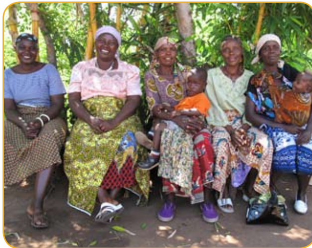
▲ Members of 'Good Ark' have enthusiastically embraced a range of agroforestry technologies.

Before they began planting their fodder banks – the main species they grow are two nitrogen-fixing trees, Gliricidia sepium and Leucaena leucocephala – they used to get, on average, around 3