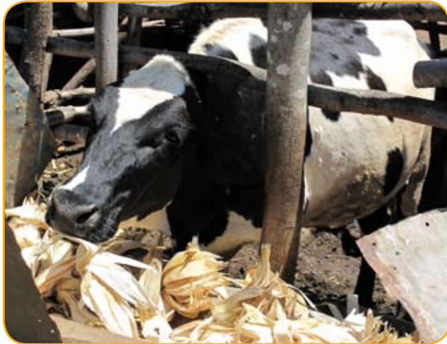
▲ The HASHI project has also helped farmers to improve their dairy enterprises.