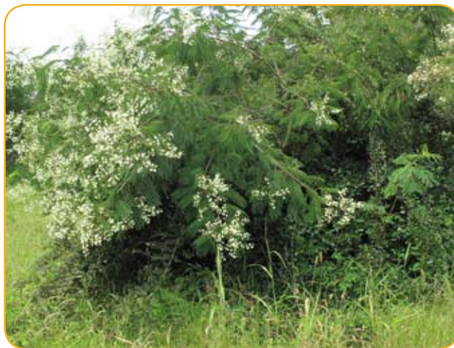
▲ Flowering trees provide pollen for honey bees.