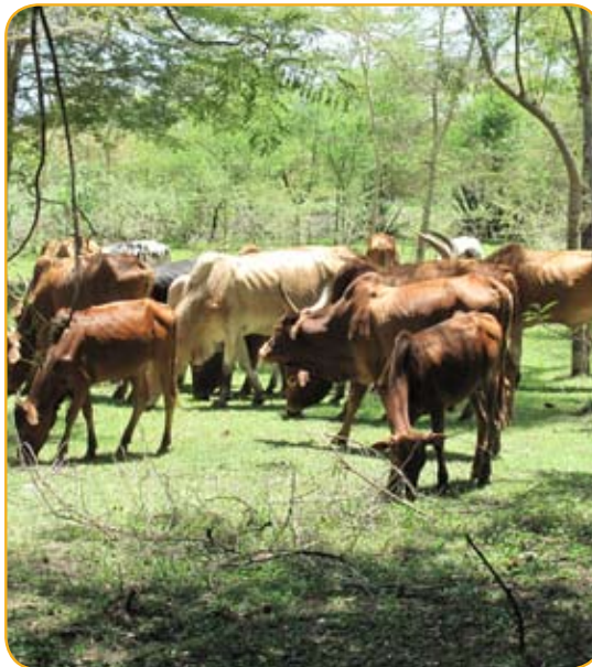
▲ Woodlots are a source of fodder as well as fuelwood.

In the village where Maganga lives, herders caught grazing cattle illegally inside an ngitili are fined 20,000 Tanzanian shillings (US$14). There is a similar penalty for illegally felling a tree inside an ngitili . "And if somebody does something really serious,