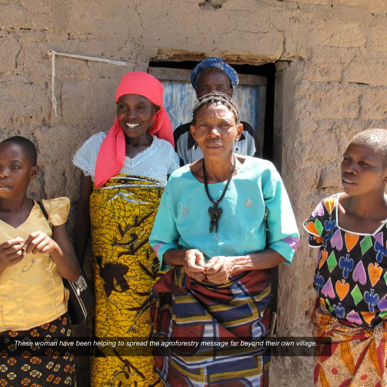
These woman have been helping to spread the agroforestry message far beyond their own village.