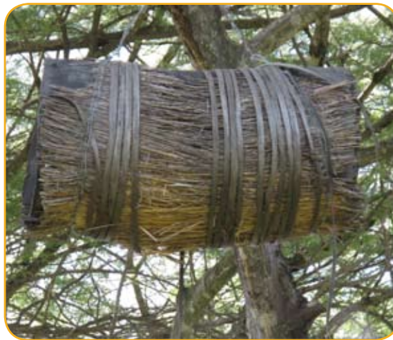
▲ A traditional beehive in Mr Maganga's ngitili .

“The definition of ngitili also varies from one place to another,” explains Chrispinus Rubanza. “In some areas, people will refer to a crop fallow, left untouched for a few years to regenerate naturally, as ngitili , but for others ngitili must have a covering of scrub and trees.” Otsyina points out that farmers who have established woodlots, but decided not to harvest the trees, often refer to them as ngitili , especially when they manage them as a source of livestock fodder.