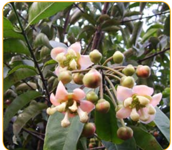
▲ A male Allanblackia tree in flower.

An individual tree can produce up to 300 fruits a year, with the average bearing 100–150 in a good season,