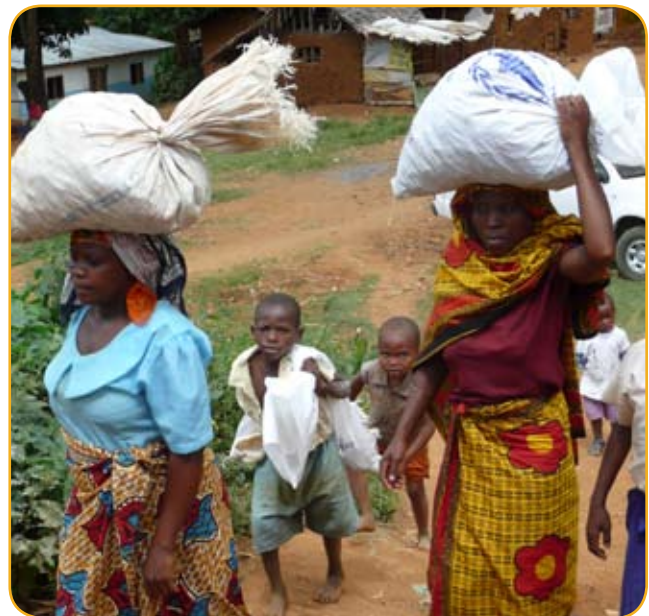
▲ Delivering seeds to a collection centre in Tanzania. The market for Allanblackia seeds has helped women like these to increase their incomes.