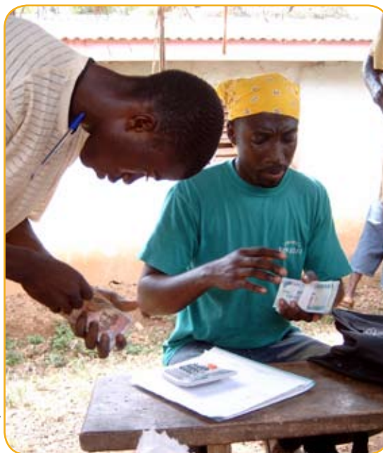
▲ There are no problems with late payment. Allanblackia harvesters in Ghana get cash on delivery.

“There simply weren’t a million trees available with fruit to harvest,” explains Rutatina. Half of those identified in the inventory were probably male; and of those which were female not all would have been good fruiting trees. The Novella Project also failed to take into account the issue of density. “The greater the distance between trees, the less incentive there’d be for harvesters to collect their fruit,” explains Hendrickx. Many of the trees that appeared in the inventories were therefore of no commercial interest.