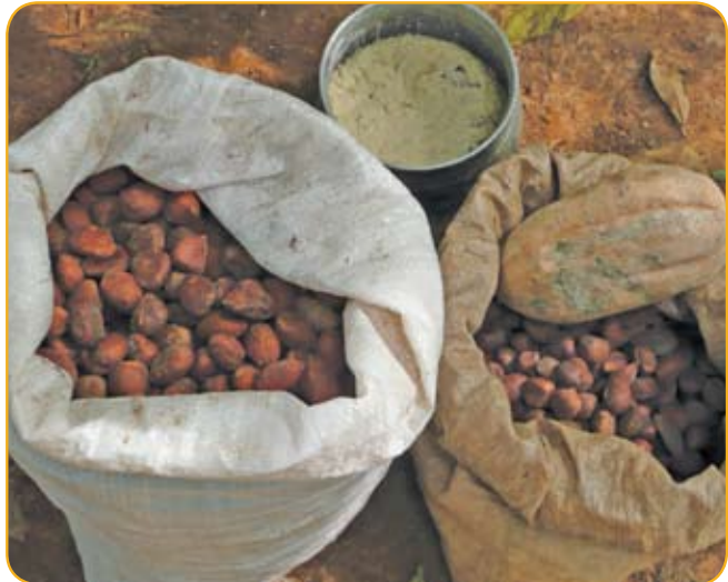
▲ Sacks of Allanblackia seeds, a whole fruit and a pot of Allanblackia cooking fat in a village in Ghana.

The Novella partners also hope that some 10,000 hectares of degraded land will benefit from reforestation schemes using Allanblackia and other species. Besides encouraging biodiversity conservation in areas where Allanblackia is grown, the Novella Project has the goal of doubling farm income for those involved in Allanblackia cultivation by 2017. Eventually, the project partners believe that several million farmers in Africa could benefit from the trade.