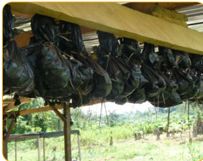
▲ Storing seeds in black plastic bags encourages quicker germination.

These two methods of encouraging germination – seed-coat removal and storage in black bags – were now adopted at FORIG with good results, and in many Allanblackia nurseries you will see black bags of seeds hung from branches and roof joists like rows of hibernating bats. The project is now getting seeds to germinate from four weeks onwards.