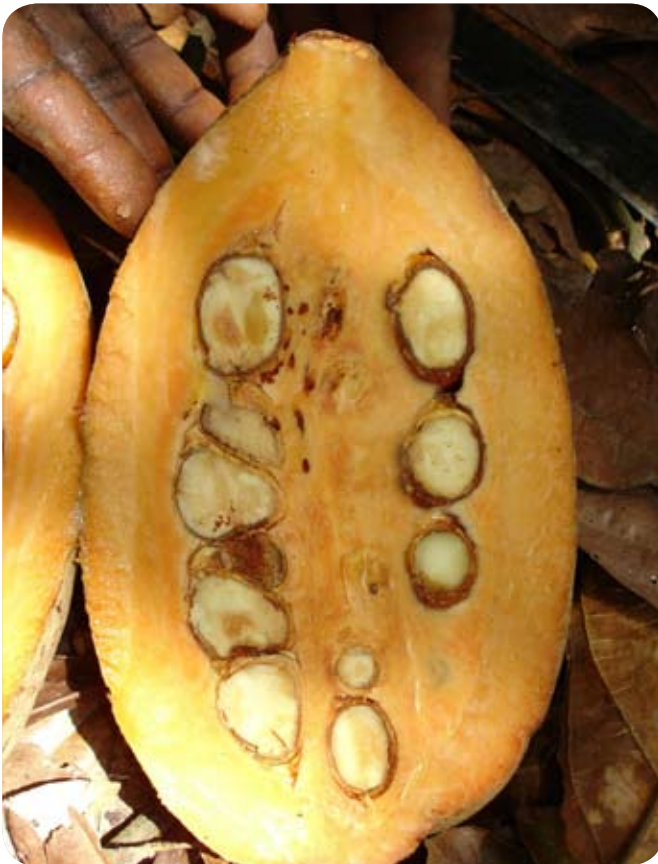
◀ The heart of the matter – Allanblackia seeds embedded in yellow pulp.

Allanblackia . Among other things, the guidelines suggest that organisations and individuals involved in harvesting should encourage the regeneration of Allanblackia , refrain from felling Allanblackia trees and respect existing wildlife legislation. When it comes to domestication, the Novella Project believes that every effort should be made to resist the establishment of large-scale monocultures.