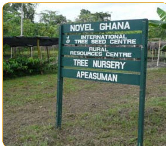
▲ By 2009, over 100,000 superior Allanblackia trees, most raised in nurseries like this one, had been delivered to farmers by the Novella Project.

In 2008, the European Food Safety Authority concluded that Allanblackia seed oil was safe for human consumption, and by the end of 2009, Tanzania alone had shipped 10 containers of