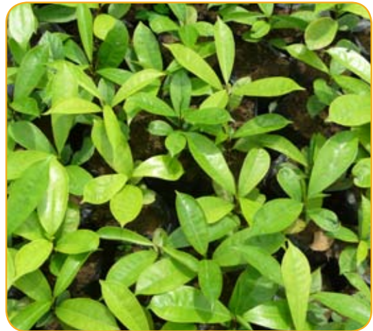
▲ Years of research have gone into establishing the best means of propagating Allanblackia. These seedlings will be used as rootstock for grafting.

After the World Agroforestry Centre joined the project, research in Ghana and Tanzania initially focused on working out how to get Allanblackia seeds to germinate swiftly. Some experiments were outright failures. For example, when growth hormones were applied to break seed dormancy, a commonly used practice, the entire batch of 80,000 seeds died. However, a process of trial and error, assisted by the knowledge of local farmers, eventually began to bear fruit.