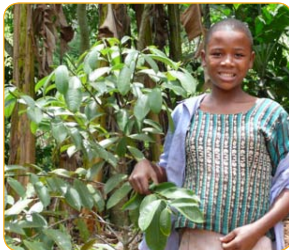
▲ Many farming families in Tanzania are now planting superior varieties of Allanblackia on their land.

The oil consists almost entirely of stearic and oleic acids and it has a very sharp melting point, around