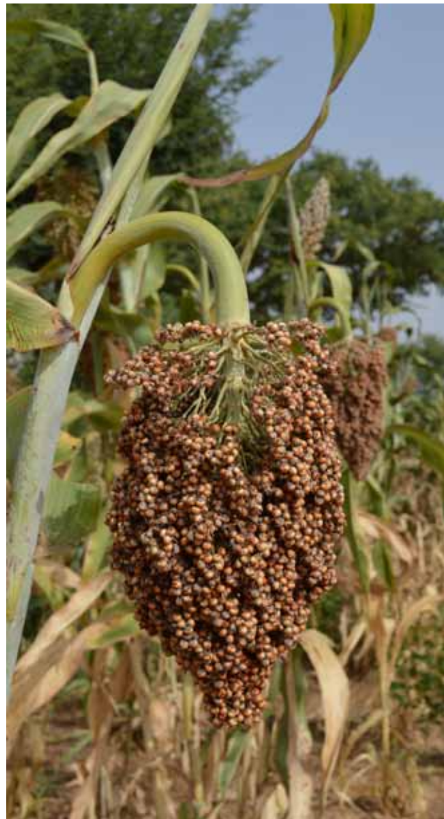
A fine harvest of sorghum in a field with Faidherbia.