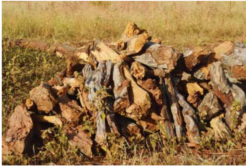
Natural regeneration has provided farmers with timber and fuelwood to use and sell.

During recent years, many villages have established wood markets, and these are proving a considerable success. In Dan Saga, for example, a market was established in January 2008. Wood is collected at the roadside from farms and sold in the centre of the village. This is not a free for all, and community organizations have established rules about which species can