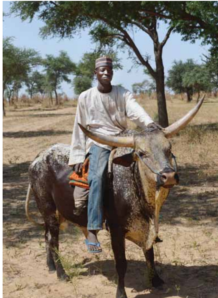
This is the traditional form of transport for many farmers.

In many Faidherbia -rich areas farmers are practising natural regeneration. They protect and prune the shoots which rise from underground roots and they place thorn fences around self-seeded saplings to protect them during the dry season, when pastoralists have the right to graze their livestock wherever they wish.