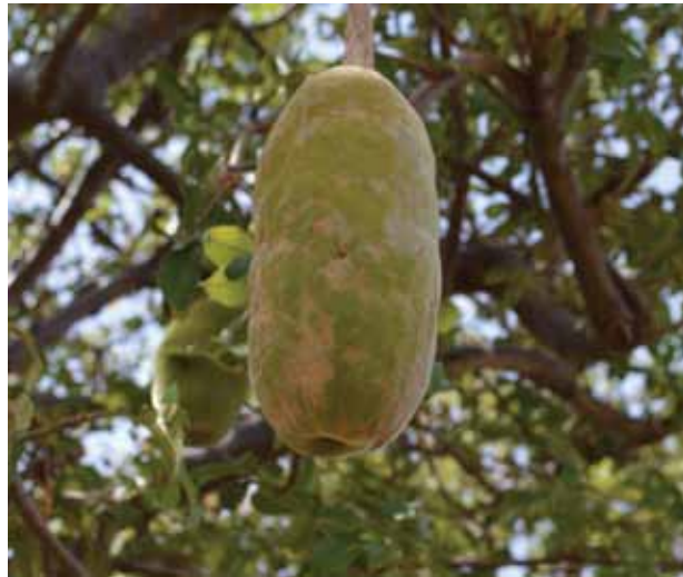
Baobab fruits are highly valued for the juice they provide.