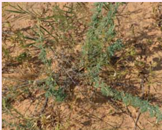
Farmers are now protecting shoots like these.

Farmer-managed natural regeneration – la régénération naturelle assistée in French, sassabin zamani in Hausa – is a practice which involves identifying and protecting the wildlings of trees and shrubs on farmland. It depends on the existence of living root systems and seeds. Shoots from roots grow more rapidly than saplings from seed, and they make up the bulk of the protected woody matter on farms in southern Niger. Farmers will generally choose five or so of the strongest