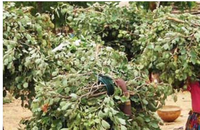
During the dry season, fodder from trees helps to sustain livestock.

In Dan Saga, for example, increasing numbers of villagers began to encourage natural regeneration in their fields. Before long, the benefits – especially the increase in wood products – were obvious; so obvious, in fact, that neighbouring villagers began to steal their firewood. This prompted the chief to set up a general assembly and the villagers agreed to establish surveillance committees with powers to arrest anybody who was found stealing firewood or timber. Over the years, the farmers here benefited from training provided by INRAN, the World Agroforestry Centre and a succession of projects funded by IFAD. There has been a strong emphasis on establishing institutions to promote natural regeneration and ensure that the trees and bushes are well protected.