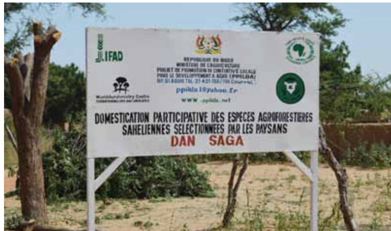
The domestication programme in Dan Saga is developing superior varieties of parkland trees to plant in farmers' fields

However, this was a period of declining revenues and central government began to lose its grip on remote regions such as Maradi and Zinder. Lacking financial and logistic resources, forest agents were no longer able to patrol the villages and their activities were limited to enforcing the law at road blocks.