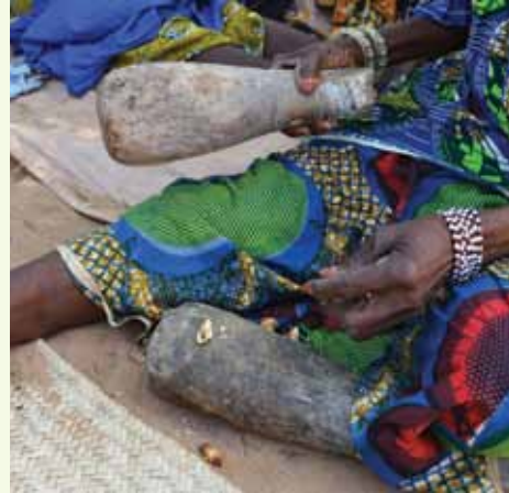
Cracking Balanites seeds requires time and patience.

The women are helping Tougiani and his colleagues to collect different provenances of Balanites , which are now the subject of research in local nurseries. Eventually, it is hoped that this participatory domestication programme will provide villagers with vigorous saplings to plant in their fields.