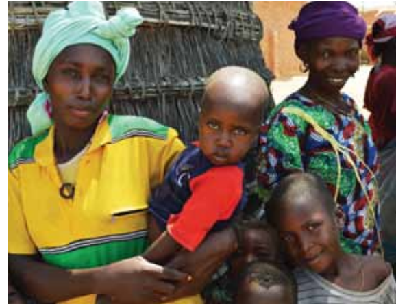
These women in Dan Saga have benefited from better crop yields, thanks to the regeneration of their parklands.

Such were the benefits, which are described in the next chapter, that Rinaudo continued to promote the practice during a series of drought-related famines in 1984 and 1985. In return for ‘food-for-work’, farmers in over 100 villages agreed to prune and conserve regenerating trees in their fields. In the area where SIM operated, 88% practised some form of natural regeneration, adding around 1.25 million trees to the landscape each year. Word began to spread from farmer to farmer, and towards the end of the decade farmer-managed natural