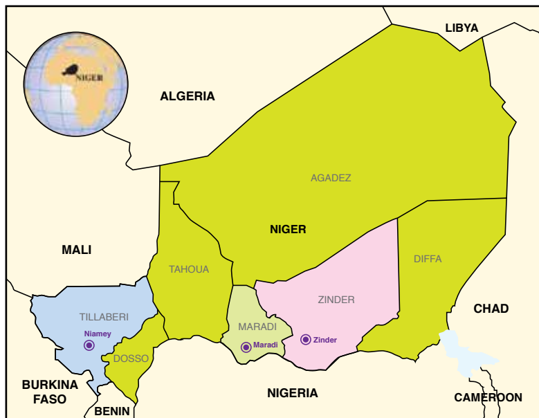
Most of the research on farmer-managed natural regeneration in Niger has focused on the regions of Maradi and Zinder.