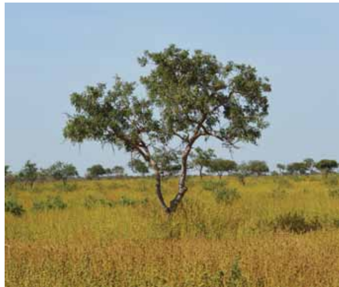
Uncontrolled grazing and wood cutting in Dankada-Dodo Classified Forest have led to the proliferation of the weed Sida cordifolia .